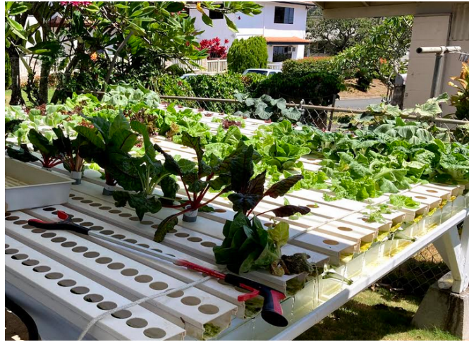
The plants begin in spongy "oasis" for two weeks. They are then moved to the smaller holes for two weeks and finally the large holes for a final two weeks.

Dan and Mai have a ten foot module but for a family of four people, Dan estimates that a three to four foot module would be sufficient. Currently, the Chings are growing two kinds of bok choy, butter lettuce, baby romaine, red oak, and Swiss chard. While they are focusing on greens, other kinds of plants can be grown with larger hole sizes and netting. A benefit of this visit was being gifted with a sampling of the produce! I can honestly say these hydroponic greens made some of the most delicious salads I have ever eaten! If I had three thumbs, this would be a three thumbs up operation!