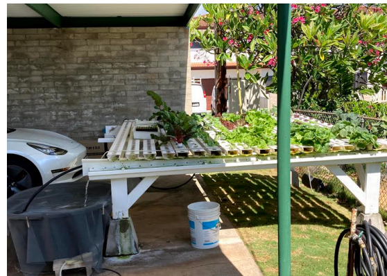
Water flows down the wells set on a slight decline, hydrating the root systems of the plants. The water exits at the end, returns to the tub and is then pumped back up again.