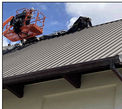
A crew member walking along the very tiptop of the church roof, dragging 200lbs. of tenting material.