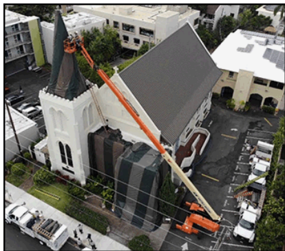
Fumigation crew wraps the tent around the steeple.

Monday and Tuesday, April 26-27, the church building underwent a complete tenting. Stephanie Wight, who is doing a masterful job in organizing our archival material, found a newspaper photo of the church tented in July 1994. We believe this to be the last time this occurred. Spot treating for termites has been occurring over the years, but it was definitely time for the "BIG" tent! Also, during the tenting process, the cross that fell off the steeple into the steeple gutter was brought down enabling work to begin on determining cost for replacement, a mounting structure, and getting it atop the steeple. Thank you to Sandwich Isle Pest Solutions for taking on this tenting challenge and to Terry Dang for prepping the buildings and watching over this huge project. Due to a conduit between the buildings and as an extra precaution, the Parish Hall had to be prepped, too!