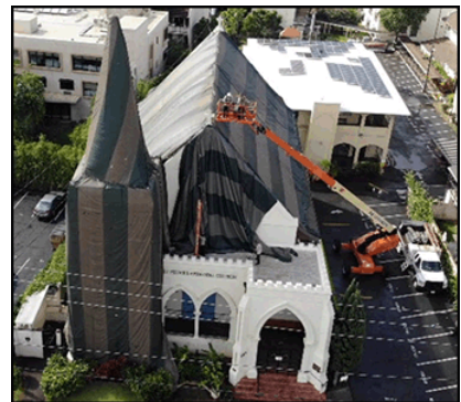
The tenting material is pinned at the top and unfurled over the sides.