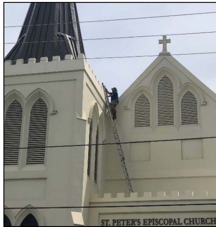
An estimator climbing up the ladder to view the steeple gutter system.