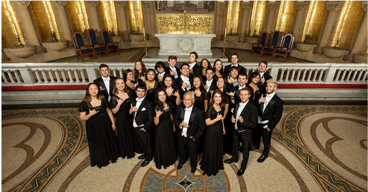
The Stanford University Chamber Chorale