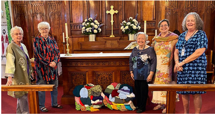
Members of the K2P2 ministry gathered to bless their knitting at church. These items will be sent to Pine Ridge Reservation.