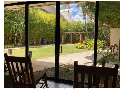
Photos are taken from the first floor of Hope Lodge.

Ever wonder what's on the other side of the rock wall separating St. Peter's property and Hope Lodge, the American Cancer Society's lodging for cancer patients mauka of the Parish Hall? A beautiful meditation garden!