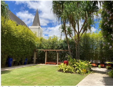
St. Peter's steeple in the background.